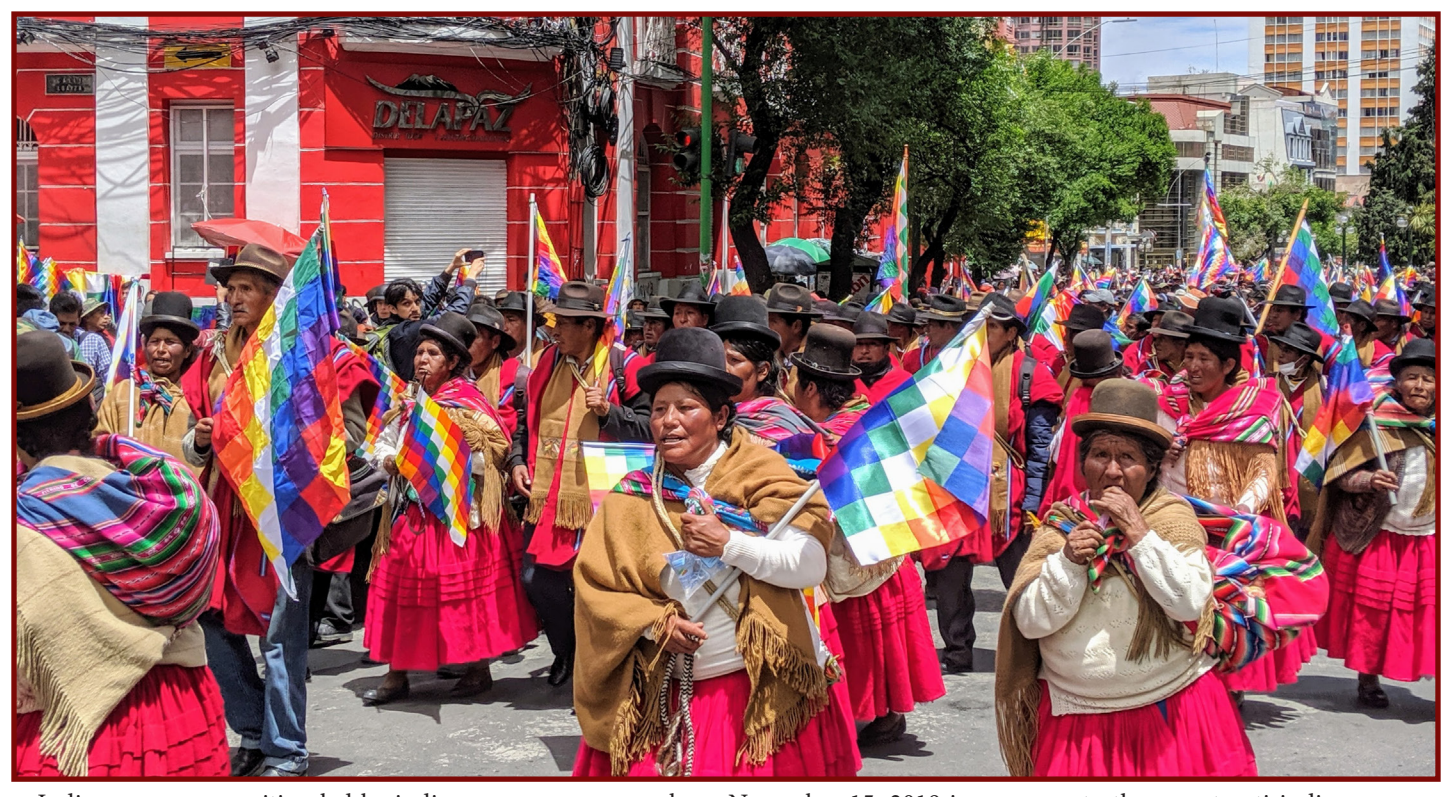
Indigenous communities, led by indigenous women, march on November 15, 2019 in response to the recent anti-indigenous attacks in Bolivia.

In 2006, Bolivians elected the country's first indi enous president, Evo Morales of the Movement for Socialism (MAS) party. Many saw Morales' election as a victory for indigenous rights and racial equality.<sup>2</sup> His government created a new constitution that codified comprehensive rights for indigenous communties and traditionally marginalized groups.<sup>3</sup> Women and indigenous Bolivians began to occupy positions of power in the government in unprecedented numbers<sup>4</sup> and poverty declined dramatically.<sup>5</sup>