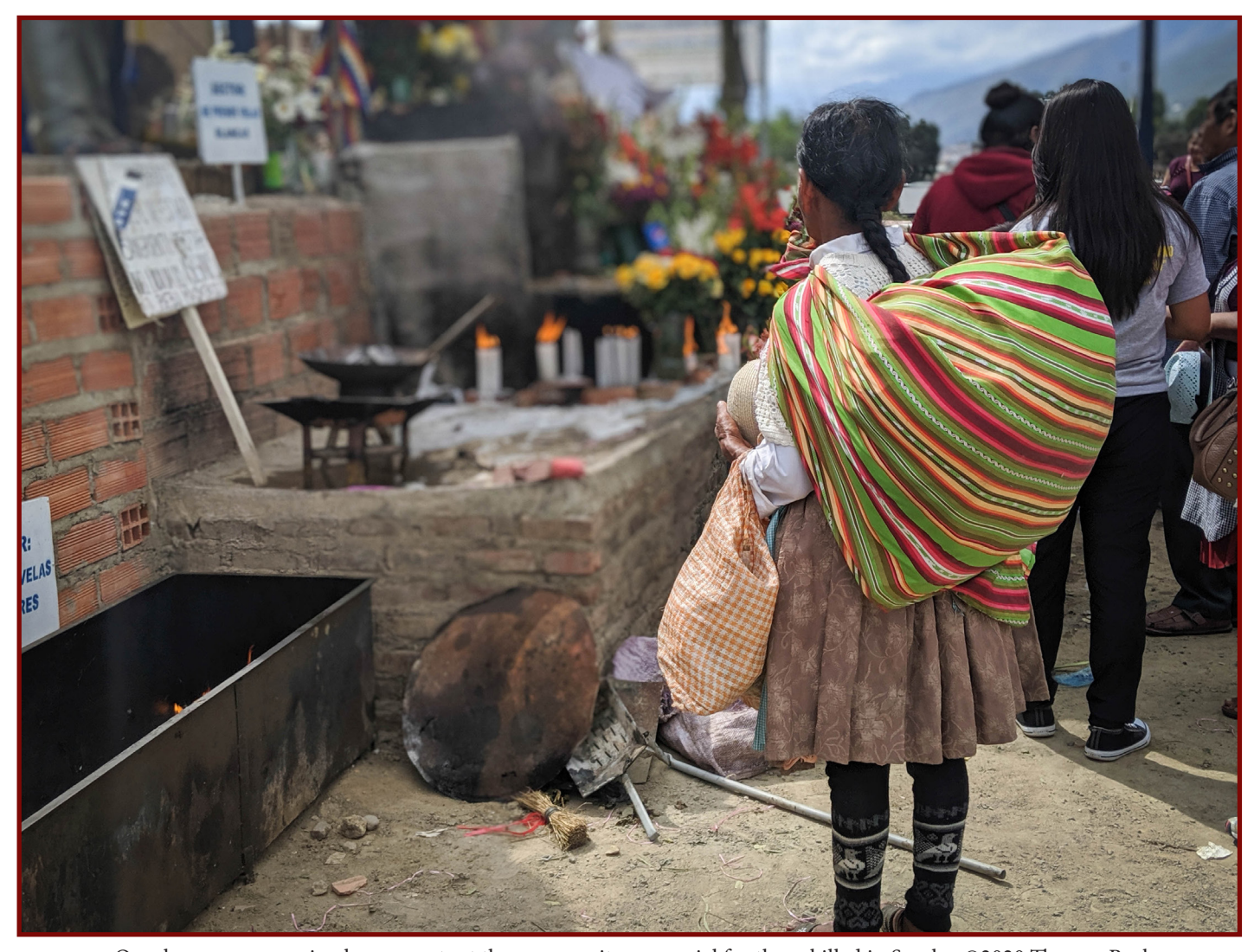
Quechua woman paying her respects at the community memorial for those killed in Sacaba.

ber 19 in Senkata – Bolivian security forces used lethal force against protesters and other civilians that resulted in significant loss of life and injuries. The IHRC collected direct eyewitness testimony, videos, and photos of the attacks that demonstrate widespread human rights abuses by the state. Specificall, the Clinic found credible evidence that: (1) state forces engaged in disproportionate use of force, using live rounds against civilian protesters; (2) military and police used racist and anti-indigenous language during violent encounters with civilians; and (3) authorities created an atmosphere