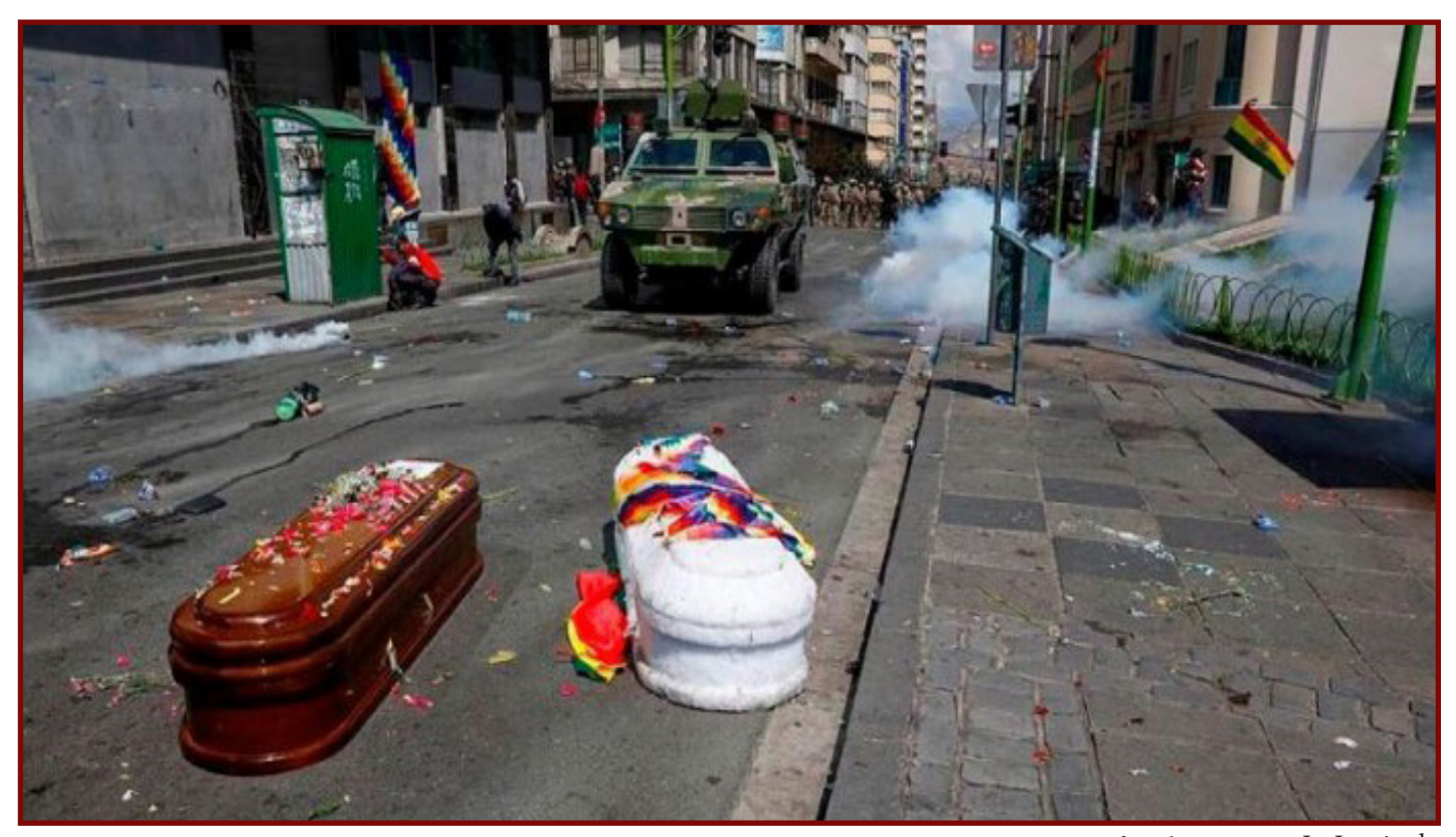
Caskets on the street in La Paz shortly after the military attacked a funeral procession for the victims of Senkata.