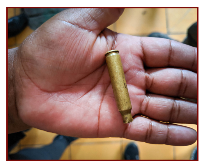
Bullet casing found in Sacaba.

and accurate investigation into the killings of their loved ones.<sup>236</sup>