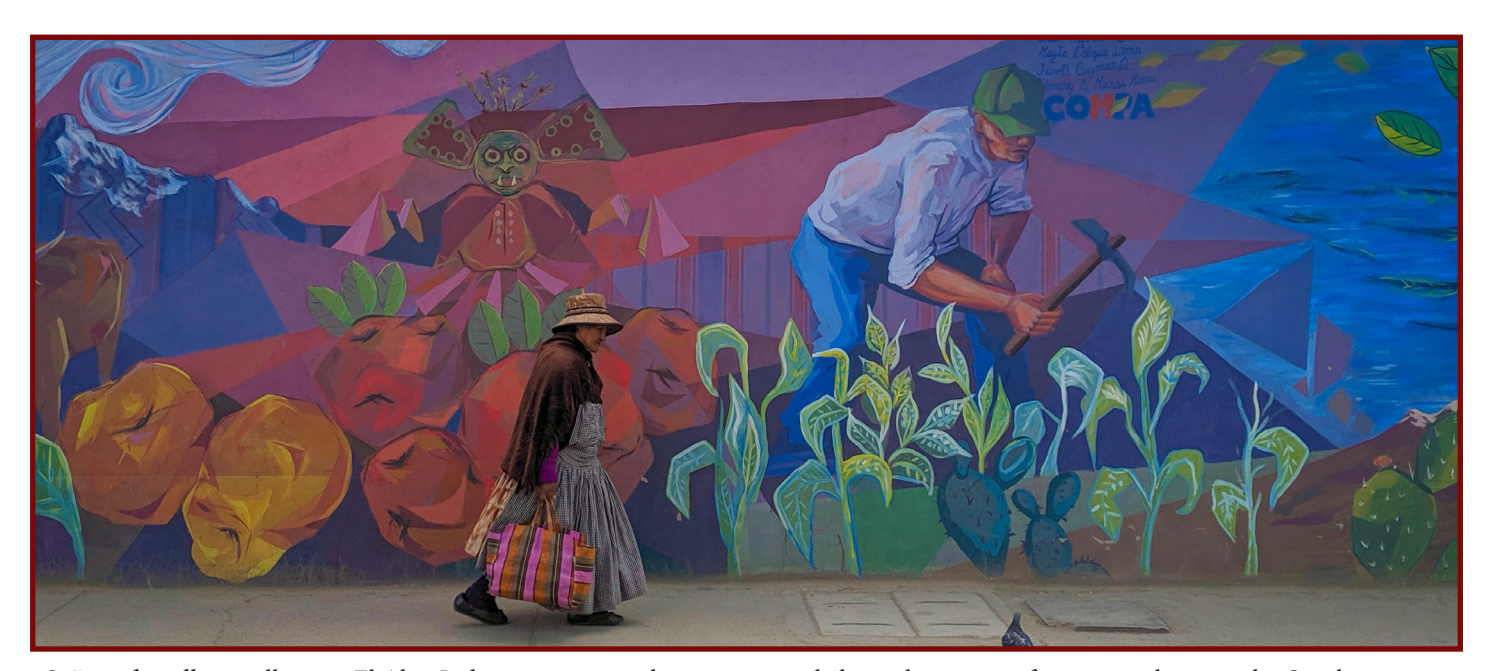
Señora de pollera walking in El Alto. Indigenous women have increasingly been the targets of racist attacks since the October 2019 elections.

According to the Mexican government, their embassy in La Paz has been surrounded by police officers in what Mexico calls a "siege" that is "clearly meant to intimidate" those within the embassy.<sup>378</sup> Mexico maintains that Bolivian police have harassed diplomats due to the presence of the asylees within the embassy, and Mexico has announced its