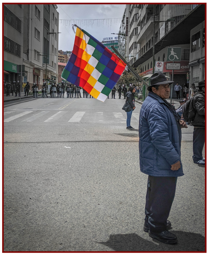
Indigenous man with wiphala in front of a line of security forces.