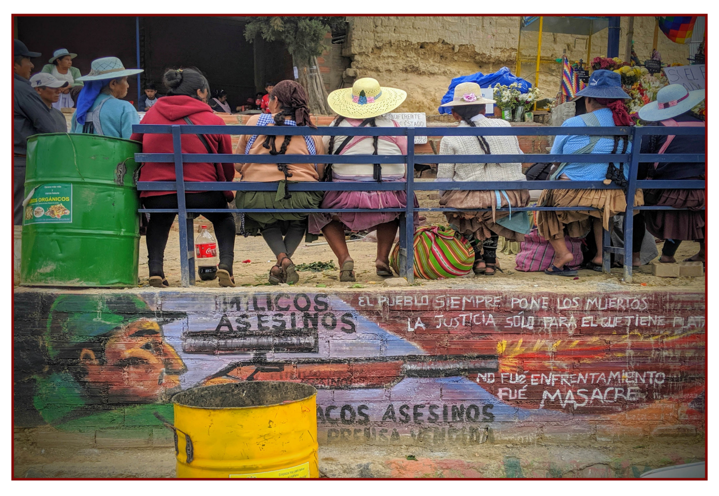
Women in Sacaba sitting above a mural stating, "Death is always for the people. Justice is only for those with money."

Numerous obstacles stand in the way of an impartial and comprehensive investigation of the violence that took place in Sacaba and Senkata. Since the November killings, the IHRC team has documented instances of evidence tampering; autopsy irregularities; overworked and under resourced prosecutors; failure of security forces to comply with lawful requests for information; and witness intimidation. These impediments are significant and facilitate