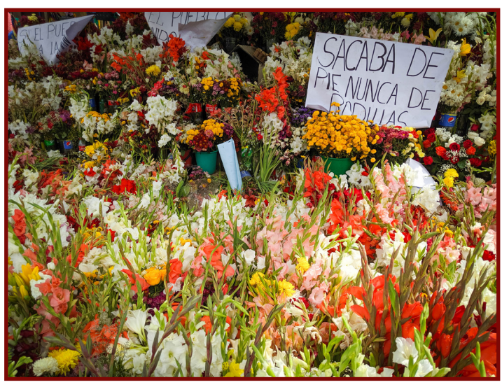
Flowers left for the victims in Sacaba. Indigenous communities frequently use the phrase "...de pie, nunca de rodillas" (standing, never on our knees) in response to repressive governments.

While the UDHR and ICCPR are applicable globally, regionally, in Latin America, the most important human rights treaty is the American