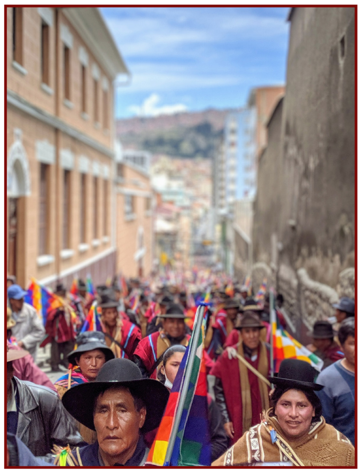
Indigenous groups march after Jeanine Áñez assumes power.