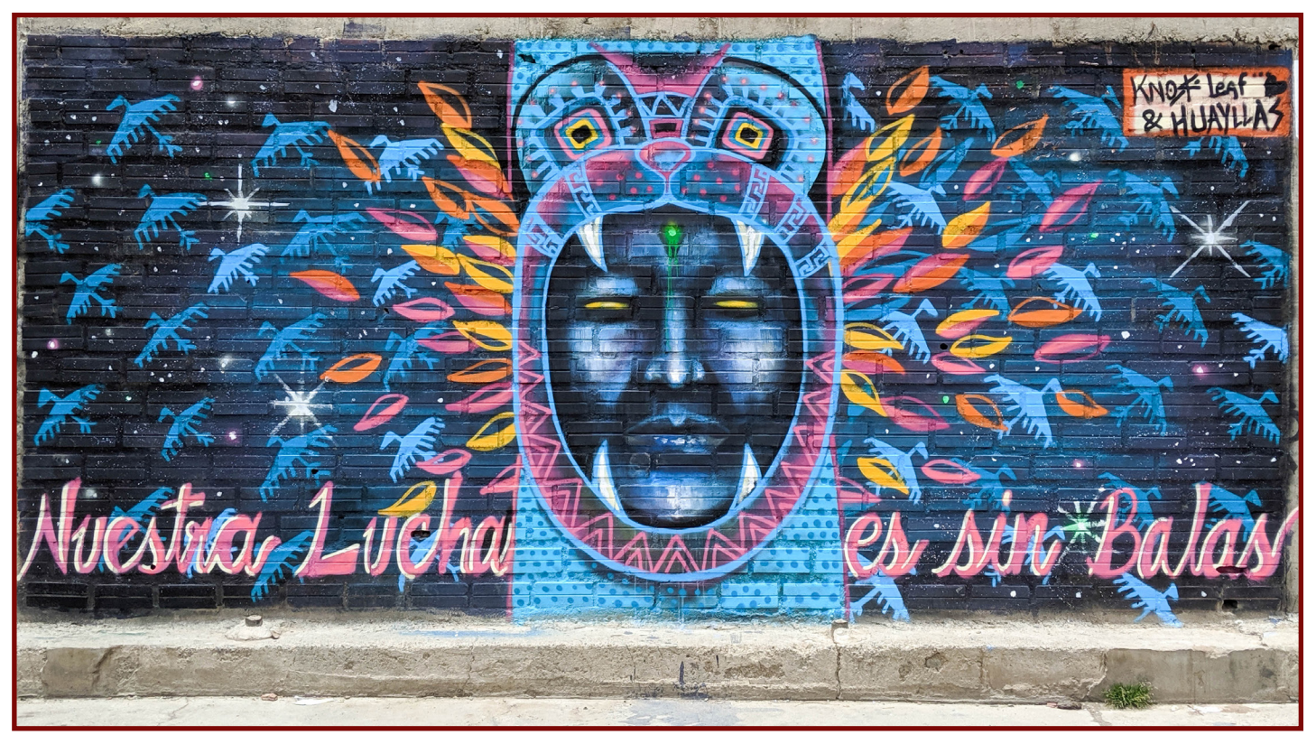
"Our struggle is without bullets," reads a mural outside of San Francisco de Asís Parish, where the wake of the Senkata victims was held. In March, police gassed this location during a meeting of community members.

with soldiers, who positioned themselves inside the Senkata plant. <sup>154</sup> On November 19, between 9:00 a.m. and 11:00 a.m., security forces suddenly and indiscriminately fired tea gas at the demonstration outside the plant. <sup>155</sup> According to eyewitnesses, soldiers aimed the gas at hundreds of demonstrators gathered in the streets and also into nearby houses where children were present. <sup>156</sup> Individuals inside their homes, who were not taking part in the demonstrations outside, were surprised and unprotected, so they broke the windows of their homes and poured out into the streets to escape the gas that suffocated them. <sup>157</sup> One passerby described seeing "grandmothers and children running from their houses…It was horrible." <sup>158</sup>