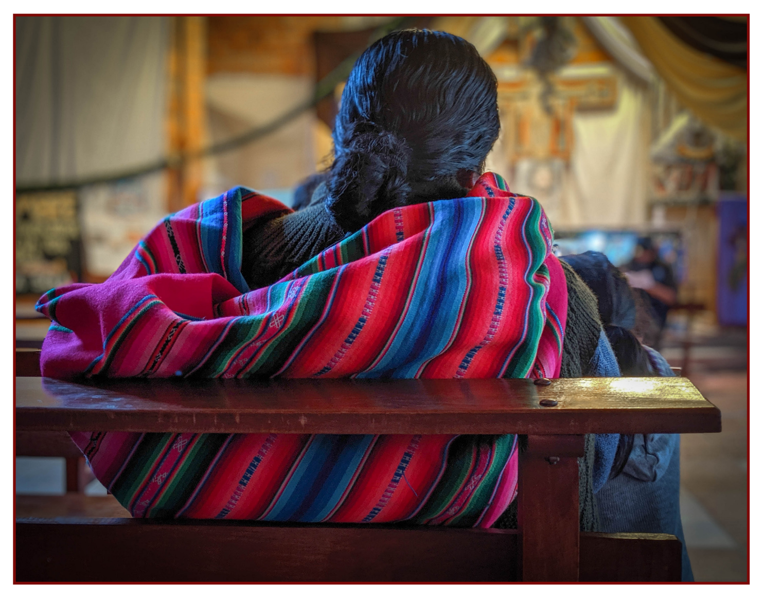
Mother at San Francisco de Asis Parish. The parish was turned into a makeshift morgue following the Senkata killings.

to provide testimony that day expressed that they were frightened to tell their stories because of the presence of hostile, heavily-armed police, many of whom were the same officers involved in the crac down on November 15. The Director of Andean Information Network, which works on human rights issues in Bolivia, noted, "The aggressive, abrasive attitude of the police officers and their treatment of human rights observers was problematic considering those same forces played a key role in the massacre just months before, creating a difficult situation for families and witnesses who could