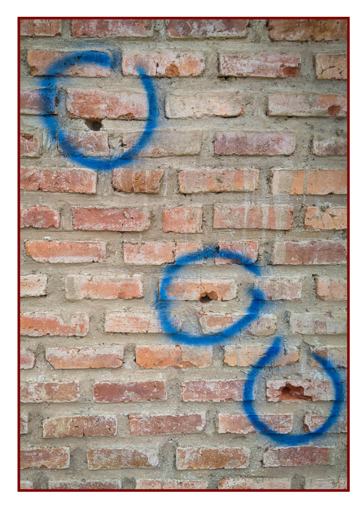
Bullet holes on the wall of a house in Sacaba. The wall faces the Huayllani bridge, where soldiers were stationed on November 15, 2019.