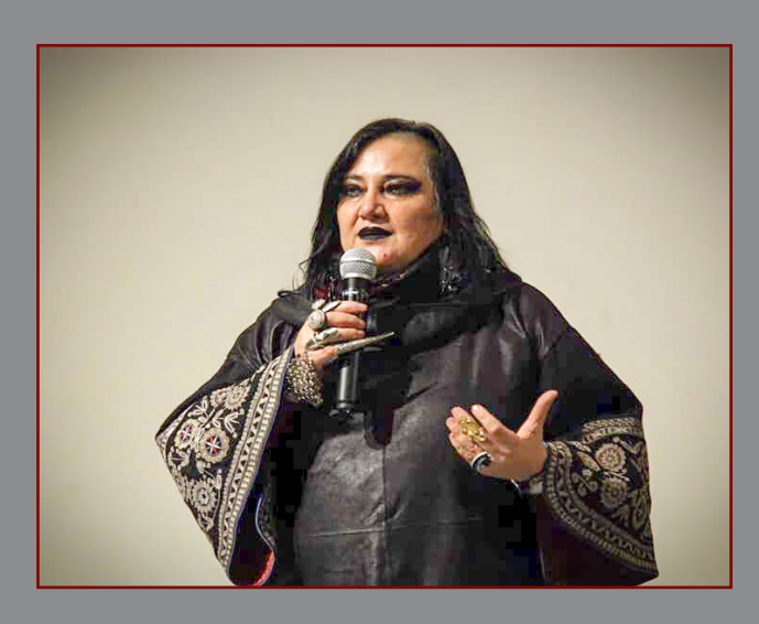
Writer and activist Maria Galindo gives lectures at universities around the world on issues such as feminism, indigenous rights, and social movements.

Página SIETE originally pulled the piece but eventually published it accompanied by an editorial note dismissing its contents for lack