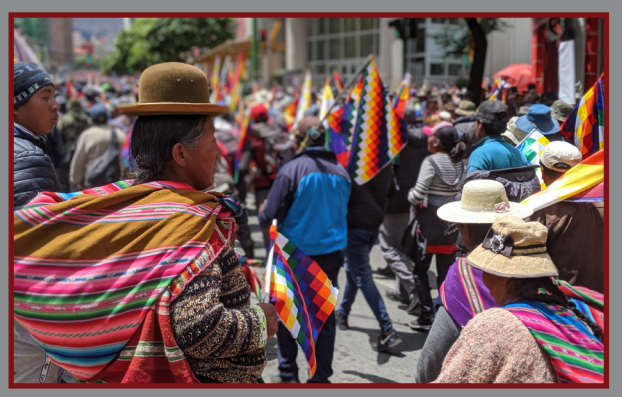
Aymara woman in La Paz.

Other instances of SGBV have been committed by para-state actors or civilians acting under state-sanctioned impunity. During a vigil at Cochabamba's City Hall, a group of women were