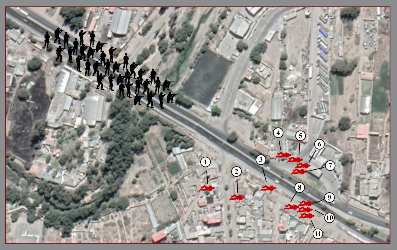
Map of Sacaba on November 15, 2019. The location of the casualties in red are based on GPS coordinates taken by the IHRC. The location of the soldiers in black are based on videos, photos, and testimonies of protestors, bystanders, and government officials.