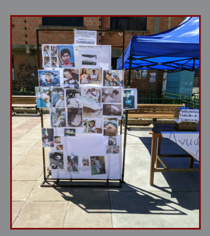
Fundraiser for Senkata Victims.