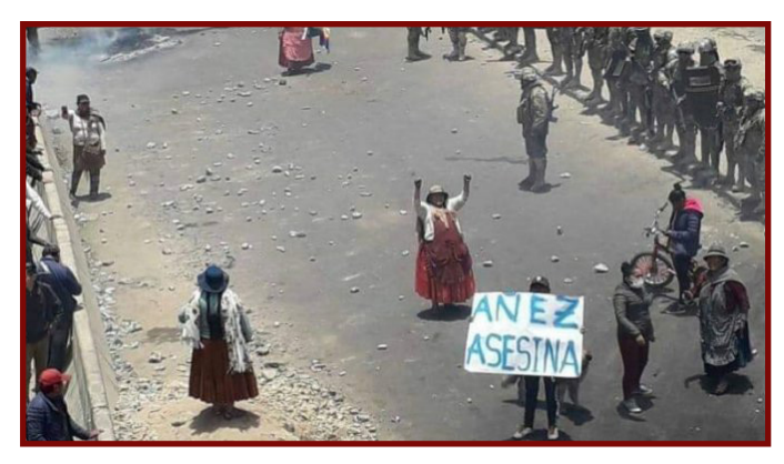
Protestors in front of Senkata plant shortly before soldiers began shooting at them on November 19, 2019. One marcher is holding a sign that reads, "Áñez murderer."

Protestors and bystanders outside the plant also reported seeing soldiers drag at least one wounded or dead person into the plant in the afternoon, after the initial teargassing from around 9:00 a.m. to 11:00 a.m. <sup>182</sup> Witnesses stated that people were worried that soldiers would disappear the bodies of the