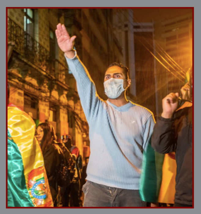
Anti-Morales protestor at a march in November 2019 giving the Nazi salute. Though most anti-Morales protestors did not act this way during the 2019 demonstrations, there has been an upsurge in racism since the 2019 elections.

The widespread anti-indigenous backlash in Bolivia raises concerns that Bolivia is returning to the days when indigenous people were treated as second class citizens. One indigenous man recounted a recent scene that was reminiscent of the days of the dictatorships: "We saw them step over the wiphala and kick women in polleras . Most of