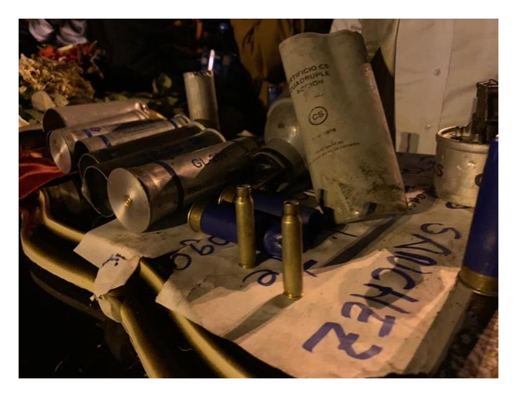
Image 2: Nov. 15 Huayllani, Tear gas and shell casings after the massacre

Protesters also denounced a press bias in favor of the police and military. They requested support from the international press, asking them to report on the abuses they suffered, such as arbitrary detentions, tear gas attacks, injuries from physical abuse, and deaths caused by bullets.<sup>38</sup>