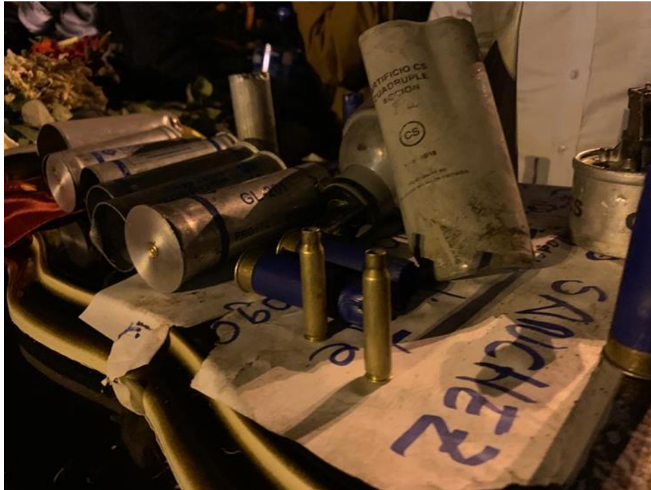
Image 2: Nov. 15 Huayllani, Tear gas and shell casings after the massacre

Protesters also denounced a press bias in favor of the police and military. They requested support from the international press, asking them to report on the abuses they suffered, such as arbitrary detentions, tear gas attacks, injuries from physical abuse, and deaths caused by bullets. 38